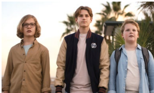
© 2022 Wiedemann &amp; Berg Film GmbH / Sony Pictures Entertainment Deutschland GmbH

Reynard Films, Katharina Weser katharina@reynardfilms.com www.reynardfilms.com